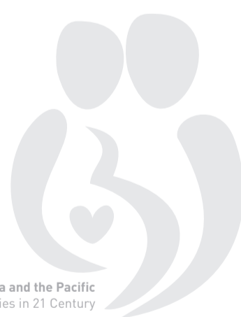
The 1 st Family Policy Seminar in Asia and the Pacific Fertility Transition and Family Policies in 21 Century